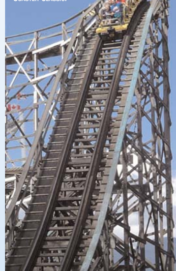
Coaster at Playland, Vancouver BC, is an ACE COASTER CLASSIC.

In addition, the most historically significant roller coasters are honored as ACE ROLLER COASTER LANDMARKS . ACE provides a prominent historic marker to educate park patrons about the importance of the ride.