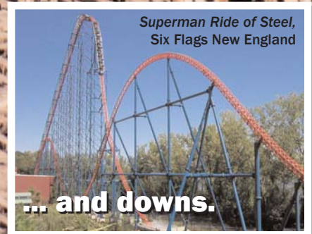
Superman Ride of Steel, Six Flags New England