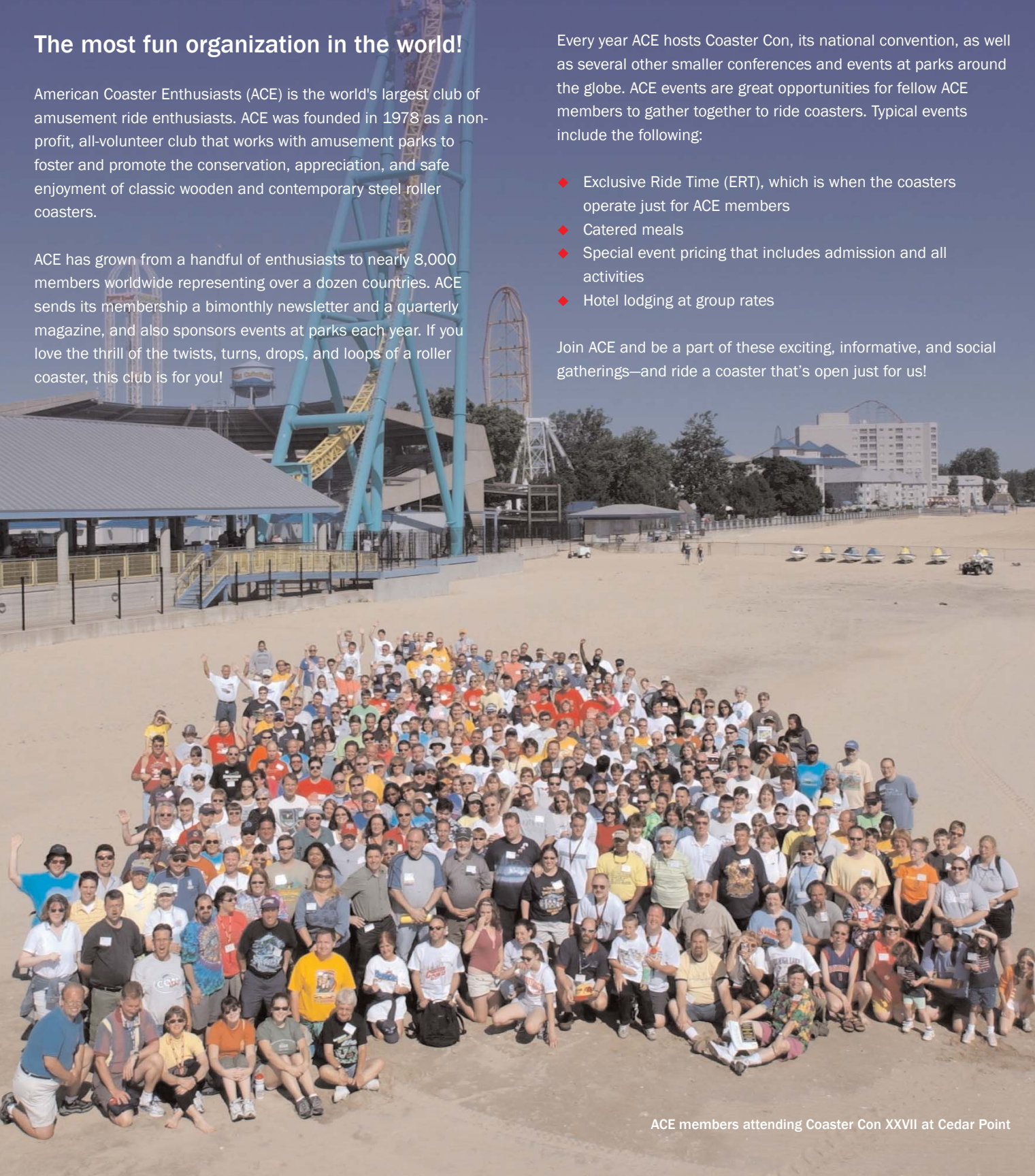
ACE members attending Coaster Con XXVII at Cedar Point