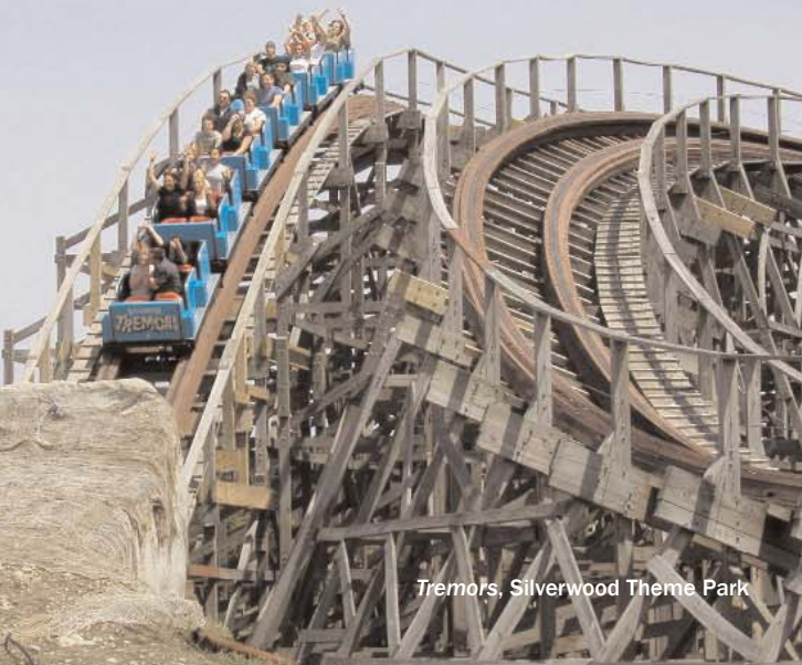
Tremors, Silverwood Theme Park